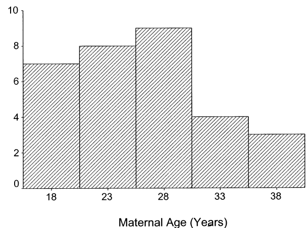
Fig. 1. Maternal age frequency histogram for all traumatic fetal deaths, Pennsylvania, 1995–1997.

related deaths to date. By far, the leading cause of traumatic fetal injury death was motor vehicle crashes. Placental separation was the leading physiologic injury diagnosis. The rate of overall reported traumatic injury-related fetal death ( \geq 16 weeks gestation) was 6.5/100000 live births, slightly lower from the nine reported by Naey (which used a slightly different definition and drew cases mostly from tertiary care centers). Applying the death rate observed in the current study to the US population suggests that at least 200 traumatic fetal